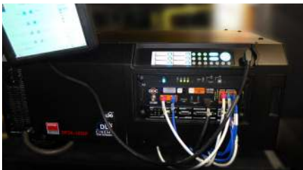
GDC SR-1000 media server

Shaw Theatres PLQ uses GDC's SR-1000 standalone integrated media block (IMB) with 2TB CineCache for nine of its screens. SR-1000, launched in 2017, is designed for near-zero maintenance to help lower the costs for cinema owners, and has high reliability on playback with redundancy provided by CineCache.