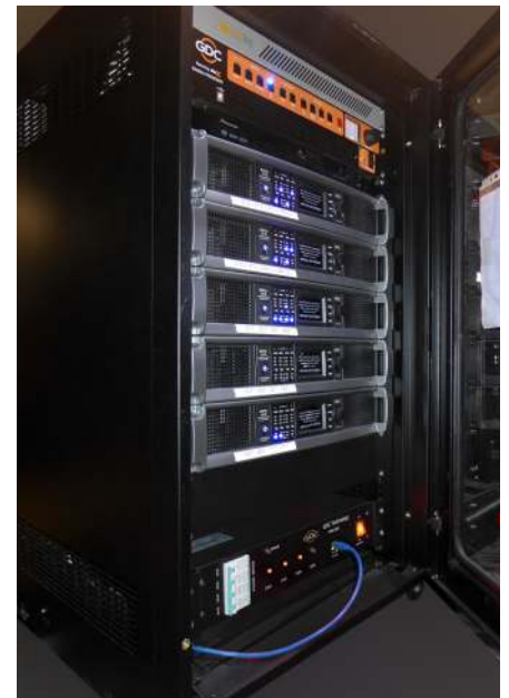
GDC's XSP and PMA-810

schedule without human intervention, saving labor and time costs and improving operation efficiency.