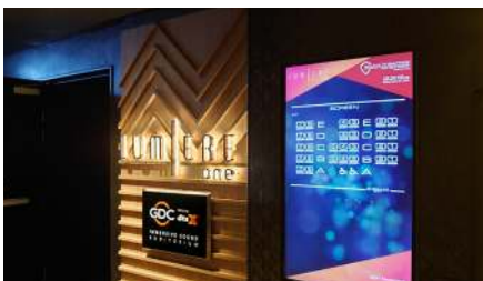
DTS:X Hall powered by SX-4000 & Enterprise Storage (4TB)

Shaw Theatres PLQ's two Lumiere suites are equipped with GDC's SX-4000 immersive sound media server and XSP-1000 cinema processor, enabling a premier immersive sound experience with DTS:X which is also demonstrated to comply with international audio standard- SMPTE ST 2098-2:2019 immersive audio bitstream specification.