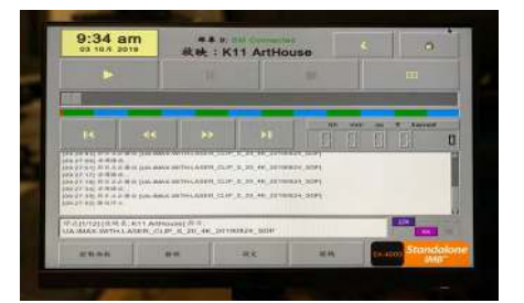
User interface of GDC SX-4000 media server

In addition, K11 Art House also uses GDC's terrestrial broadband Electronic Delivery Service (EDS), which has been the only method of delivering Digital Cinema Packages (DCP) to cinemas in Hong Kong for three years. Since the amount of data DCP's contain cannot reliably transfer over standard IP networks, DCPs are typically delivered to individual theaters by satellite, or by shipping specialized hard drives via express courier. But there are challenges with both methods — and neither is conducive to a seamless, fully digital workflow that supports further digital innovation. EDS safely enables cloud-based transferring services of up to 100GB in approximately three to five hours with 100 Mbps broadband Internet speed.