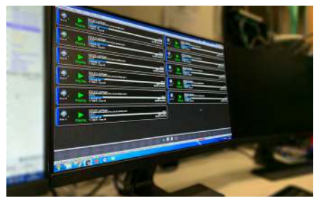
GDC TMS-2000 Theatre Management System

To manage content playback, K11 Art House installed TMS-2000, the latest generation theatre management system developed by GDC. The solution enables the cinema to be managed in a centralized manner. With more than 50 new functions and improvements based on TMS-1000, TMS-2000 features playing and equipment condition display monitoring that is from one single access and integrates screen monitor, content management with enhanced performance that facilitates centralized management of contents and KDM, a "smarter" program scheduler that gives alarm in case of the absence of CPL or the failure of KDM, and intelligent recovery that makes replacement of servers easier and faster.