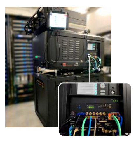
Projector in K11 Art House uses GDC SX-4000 media server