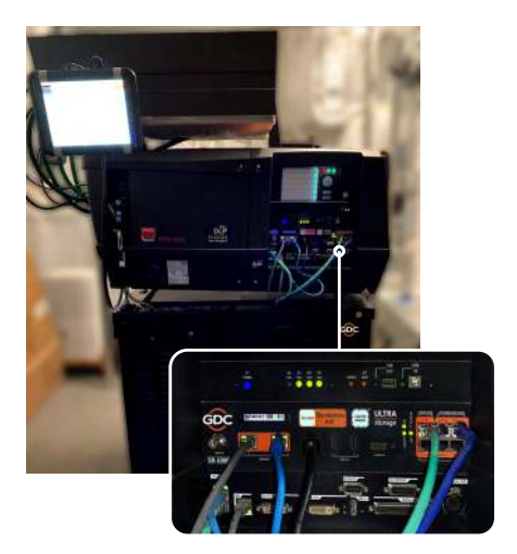
Projector in K11 Art House uses GDC SR-1000 media server