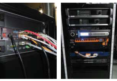
GDC's SX-4000 and XSP-1000 at projection room to deliver DTS:X immersive sound.