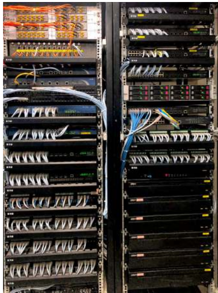
GDC SCL-2000 Centralized Playback Server and switches

With its quality sight and sound, avant-garde decoration and comfortable environment, BONA International Cinema, Hangzhou Joy City has certainly enhanced moviegoing in Hangzhou.