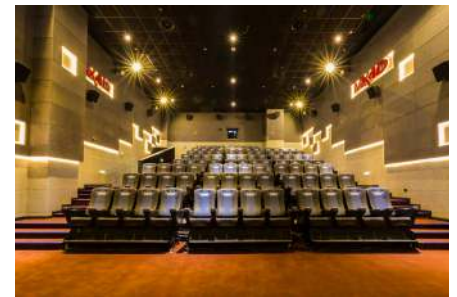
BONA ONE giant-screen auditorium