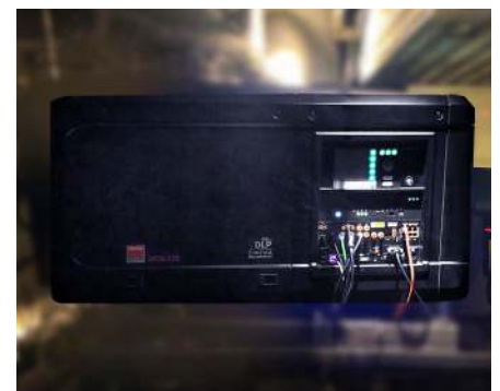
The projector with GDC SX-4000 Media Server to deliver DTS:X immersive sound