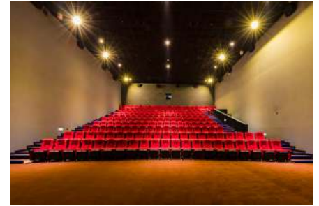
ScreenX three-side screen auditorium

location, DTS:X immersive sound is no longer bound by track signals; instead, it can present precise locations of sound in combination with pictures and thus create a more remarkable sense of emotion according to the object of sound. Thus, in the DTS:X immersive sound hall, sound comes from speakers in different locations, enabling audiences to identify the spatial location and movement trail of sound with ears and feel like they are right in the scene.