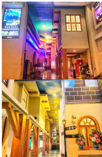
Theme of French town

The French cinema styled design permeates with culture and art. Consumers are treated to an extraordinary environment immediately after they enter the cinema. Once inside the auditorium, there are two factors that contribute to an amazing moviegoing experience and make it one of the busiest cinemas in Hangzhou.