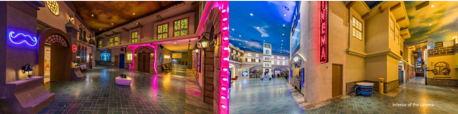
Interior of the cinema