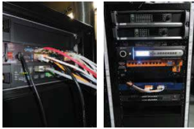
GDC's SX-4000 and XSP-1000 at projection room to deliver DTS:X immersive sound.