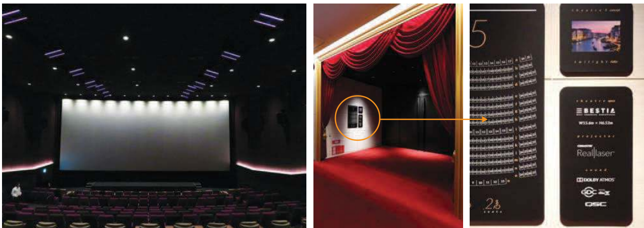
Cinema Sunshine's premium "BESTIA" (BEST IMMERSIVE AUDIO VISUAL) theatre in auditorium 5 & 6 have been equipped with GDC's DTS:X immersive sound systems

Good location, well-positioned plaza - Located in Toshima-ku, Tokyo Prefecture, Ikebukuro is one of Tokyo's three major sub-centres. Also, Q-Plaza is a very popular commercial complex that integrates shopping and entertainment. Apart from Grand Cinema Sunshine itself, another highlight of the plaza is a large entertainment section consisting of a large baseball centre and a theme park of PLAZA CAPCOM. The theme park was run by CAPCOM, which has developed many classic games like Street Fighter and Biochemical Crisis. PLAZA CAPCOM offers diverse types of recreation